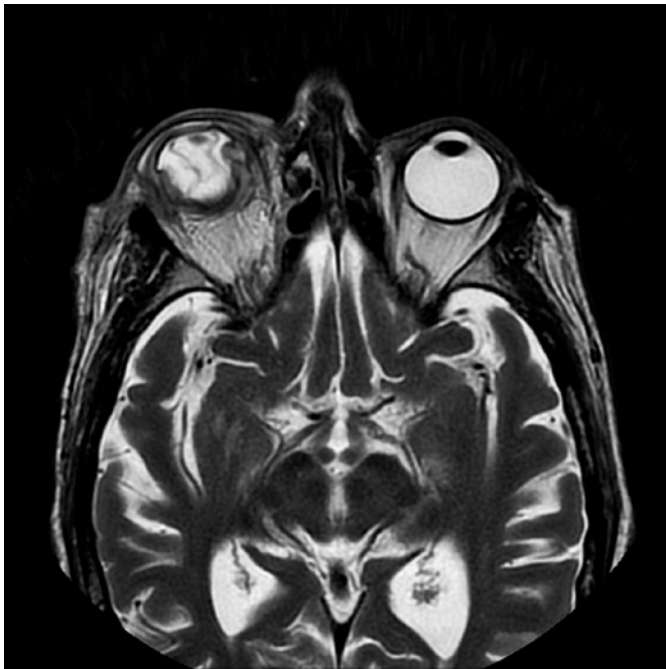
Figure 3. Orbital magnetic resonance image (MRI) showing decreased contrast of the pre- and post-septal soft tissues as compared that in the previous image, with destruction of the eyeball integrity, collapse of the anterior chamber, and retinal and choroid detachment.