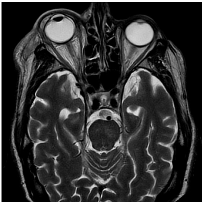
Figure 1. Magnetic resonance image showing proptosis of the right eye and increased diffuse soft tissue volume, with T2 hyper intensity in both the pre- and post-septal spaces. These findings are compatible with orbital cellulitis and small subconjunctival abscesses.

The patient had no previous history of trauma either on the affected or fellow eye. Prior to the described events, the patient had no vision complaints. The fellow eye was normal to exploration on portable slit-lamp examination, presented a normal IOP of 16 mmHg, and showed no abnormalities on funduscopic exploration. The presenting visual acuity (VA) of the affected eye was amaurosis (no light perception) from the moment