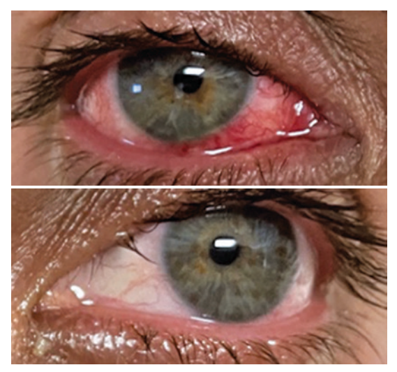
Figure 2. Anterior segment/biomicroscopy showing the presence of hyaline secretion on the ocular surface, hyperemia, and conjunctival vascular congestion with emphasis on the lower nasal quadrant "in the right eye (RE) of a man with monkeypox confirmed by polymerase chain reaction," from the respective collection of microbiological material from the ocular surface of the RE.