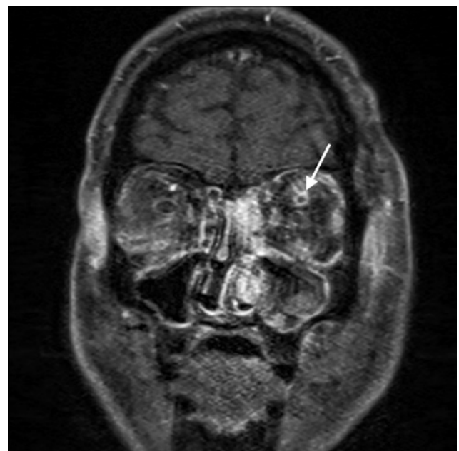
Figure 2. Coronal T1-weighted magnetic resonance image of the orbits and head on day 5, demonstrating a dilated left superior ophthalmic vein with an intraluminal non-enhancing thrombus (arrow), which is indicative of left superior ophthalmic vein thrombosis.