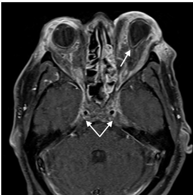
Figure 1. Axial T1-weighted magnetic resonance image of the orbits and head on day 5, demonstrating a bilateral cavernous sinus thrombosis (bottom arrows), as demonstrated by the lack of normal enhancement in the cavernous sinus and tenting of the left globe (top arrow), which is suggestive of increased orbital tension.

At 1-month follow-up, the patient was comfortable without eye pain. The examination revealed a VA of 20/20 in the right eye and NLP in the left eye, normal IOP, trace left lower lid ectropion and trace chemosis in the left eye, and notable pallor of left optic nerve, a fibrotic membrane extending across the macula, and sclerotic vessels. OCT revealed atrophy and destruction of both inner and outer layers of the retina in the left eye, consistent with sequelae of profound retinal ischemia