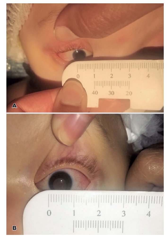
Figure 2. Corneal diameters of the right eye measuring 7 mm (A) and (B) left eye measuring 10 mm.