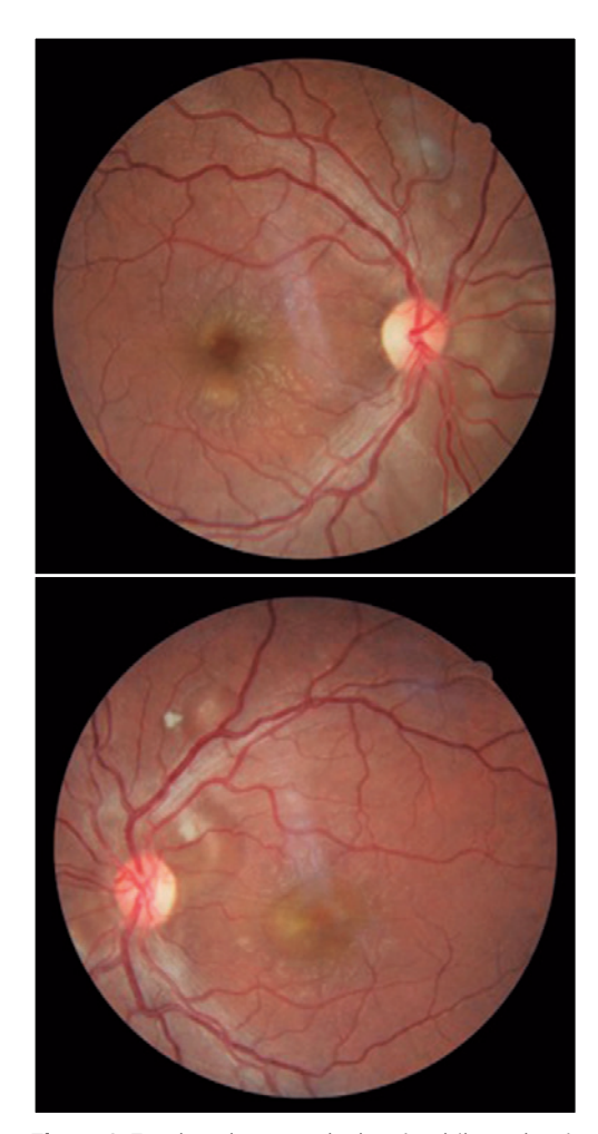
Figure 1. Fundus photograph showing bilateral retinal detachment around the disc and macular region in both the eyes in a patient with systemic lupus erythematosus