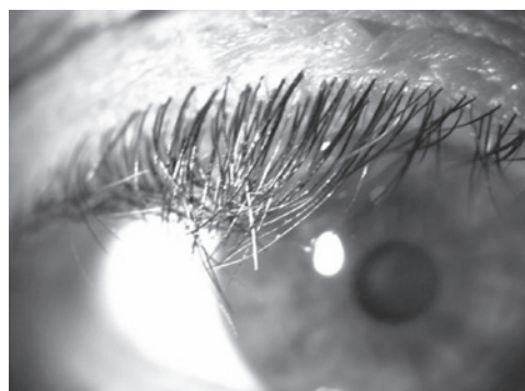
Figure 2. Trichomegaly on the right eye (Patient 2).

Nazareth et al. (11) documented 23 medications associated with trichomegaly. The most common were prostaglandin analogs, cyclosporine, interferon, topiramate and cetuximab.