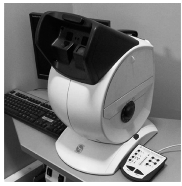
Figure 1. The functional vision analyzer contrast sensitivity test device.

The CS testing device controls light levels with sensors to achieve consistent conditions for each test. This device supplies a target luminance level of 85 cd/m<sup>2</sup> for daytime conditions in compliance with the American National Standards Institute (ANSI). It evaluates spatial frequencies using sine-wave grating charts of 1.5, 3, 6, 12, and 18 cpd. Figure 2 presents the sine-wave gratings charts for the frequencies that the CS testing device used. Contrast was defined according to the Michelson formula (C = [L_{maximum} - L_{minimum}]/[L_{maximum} + L_{minimum}] , C: Contrast, L: Luminance)<sup>(2)</sup>. CS was measured during two sessions separated by at least one week and up to one month (intersession).