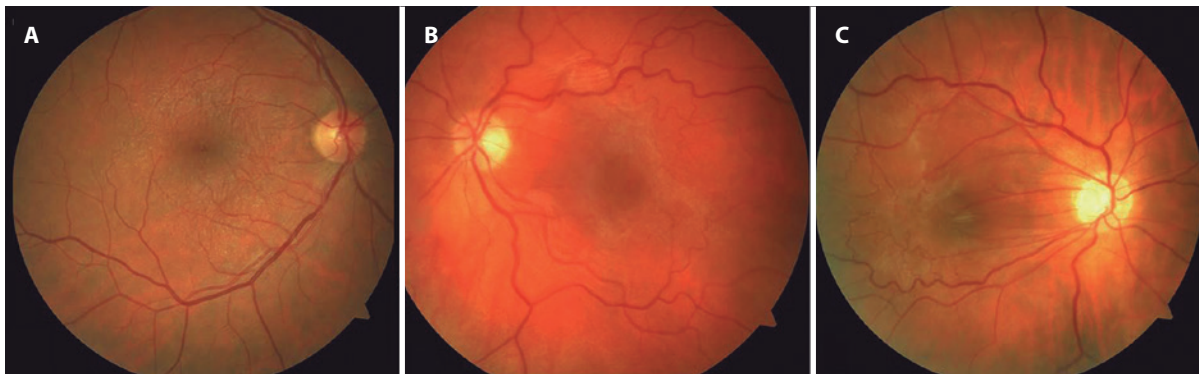
Figure 1. Fundus grading of the epiretinal membrane (ERM). A) Example of a grade 1 ERM with minimal retinal surface changes. B) Early macular striae are visible in a grade 2 ERM. C) A combination of large macular striae and prominent vascular straightening are seen in a grade 3 ERM.

SPSS version 11.6 (SPSS, Inc., Chicago, IL, USA) was used for the statistical analysis. Visual acuity values were converted to logMAR units for the statistical analyses. In addition to the linear regression analyses mentioned above, a one-way analysis of variance with a post-hoc Tukey's test was used to compare the three groups with respect to BCVA and central macular thickness. Categorical variables were compared between the groups with the \chi^2 test. A P value <0.05 was considered statistically significant.