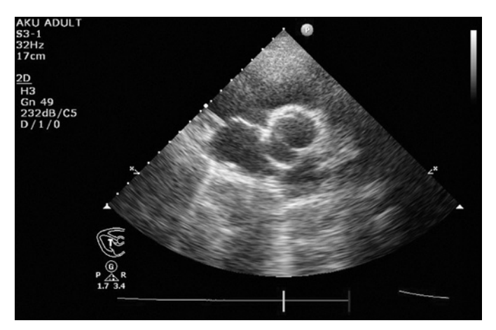
Figure 3. Bicuspid aortic valve as detected by echocardiography.

the iris, lens, choroid, retina, optic nerve, and/or ciliary body may be involved<sup>(5)</sup>. Lens coloboma is extremely rare, and its existence is still questionable. In the present case, no other ocular structures were affected, and the lack of zonules was observed on the infero-temporal side. Lens coloboma is most frequently inherited as an autosomal dominant trait. The frequency of the location of the lesion compatible with optic vesicle coloboma suggests a developmental defect in the ciliary region of the optic vesicle which forms zonules. Zonular fibers may be absent or may be attached to the notch of the coloboma. Weakening of zonular fibers may be attributed to toxic, inflammatory, and genetic factors<sup>(1,2)</sup>.