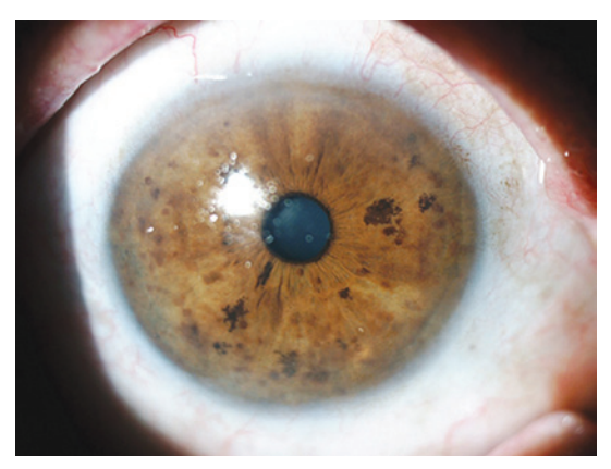
Figure 4. The disappearance of lesions 2 months after alcohol corneal epitheliectomy.

malignant melanoma. PAM is classified as with or without atypia. The clinical appearance of conjunctival PAM is unilateral and conjunctival, and it is rarely associated with corneal melanotic macule developing in the elderly. The pigmentation tends to be irregular and waxy and gradually becomes more extensive and multifocal. Histologically, diffuse, intraepithelial melanocytic proliferation can be observed, with increased numbers of melanocytes confined to the basal layer of the conjunctival epithelium. These melanocytes are either normal