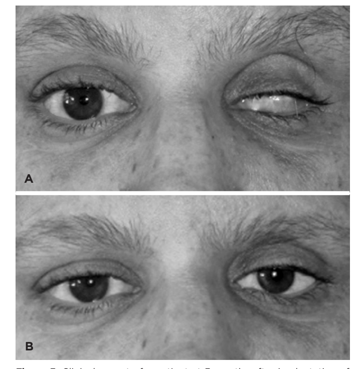
Figure 3. Clinical aspect of a patient at 3 months after implantation of the Fullcure sphere; (A) without an external ocular prosthesis (B) with the prosthesis in place.

Table 1. Mean, median, minimum, and maximum values of biochemical markers before and 12 months after surgery