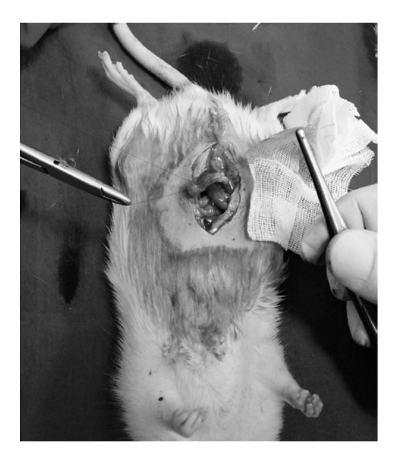
Figure 1. Procedure of oophorectomy to induce menopause in a rat model under general anesthesia.

TOS of the lens was measured with an automated colorimetric measurement method that was improved by {\rm Erel}^{(10)} . In this method,