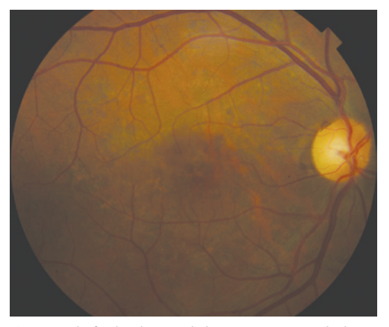
Figure 1. Color fundus photograph showing symmetric multiple uniform round yellowish lesions at the posterior pole.

and showed partial confluence with neighboring flecks (Figure 1). Imaging was performed with a Spectralis HRA + OCT (Heidelberg Engineering, Heidelberg, Germany). Areas of increased fundus auto-fluorescence (FA) were noted, with surrounding borders of decreased FA intensity, corresponding to the visible yellowish fundus lesions (Figure 2). Spectral domain optical coherence tomography (SD-OCT) showed elevated lesions along the retinal pigment epithelium (RPE)/ Bruch complex, preserving the external limiting membrane (Figure 3).